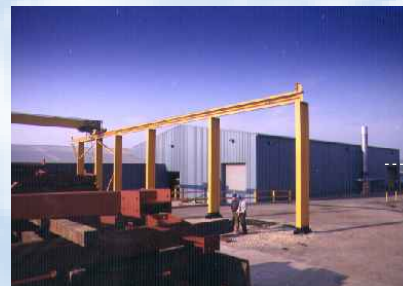
Jit systems reduces inventory increases throughput

We specialise in utilizing our work force's skills to the full. Our capabilities extend beyond the structural steelwork market into the supply of specialised and complex fabrications. We have a long history in fabricating radar towers, bulk handling gantries, silos, machine bases and storage bunkers. Our customers operate in industries as diverse as air traffic management, power distribution, information technology and material handling.