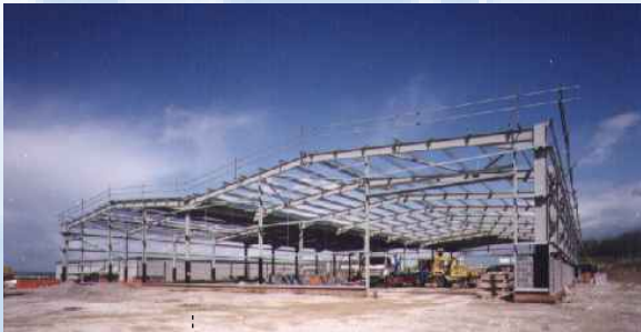
150t warehouse and offices - designed, manufactured and erected in 7 Weeks