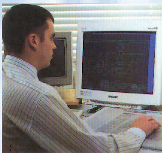
Direct links from drawing to CNC machinery reduces lead times and improves quality

We operate from a modern 40,000 sq ft factory adjacent to junction 38 of the M1. Having built up a reputation for quality and competitiveness our aim is to continue our growth through investment in new plant and machinery whilst maintaining and developing our highly skilled and experienced workforce.