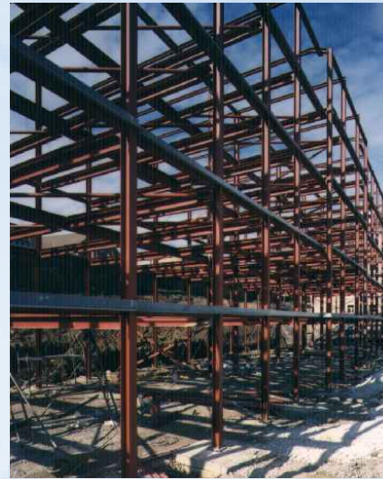
5 storey office block structure for Norwich Union